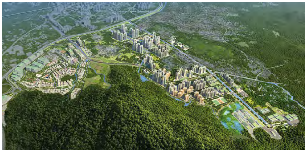
Development Area Concept Map of South Yuen Long.

Moreover, the floor loading requirement of the floor space at Hung Shui Kiu Lot to be leased to the Government will be adjusted downwards from 30 kilonewtons/sq.m. to 25 kilonewtons/sq.m., which is the same as the floor loading requirement for the Yuen Long Lot and to achieve greater consistency with the requirement for industrial buildings in general and reduce the construction cost.