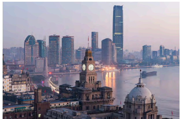
Office buildings along the Huangpu River in Shanghai.

Compared on a year-to-year basis, the performance in daily rental level per sq.m. was still behind, especially in the office markets of Shanghai, Guangzhou and Shenzhen. However, compared to December 2024, average daily rental increased by 0.63% and 5.35% to RMB 3.21 per sq.m. and RMB 3.15 per sq.m. respectively in the Guangzhou and Shenzhen office markets. The average rental level of Beijing was surprisingly back to RMB 6.26 per sq.m. per day, which is a 5.56% uplift on a month-to-month basis. One of the driving forces is the robust demand for State-Owned Enterprises, Centralized Enterprises and some monopolistic scale groups which tend to set headquarters in Beijing with most of their leases signed expiring in the period of year end. They would prefer to renew the leases even with rental uplift as their cost in relocation were particularly high.