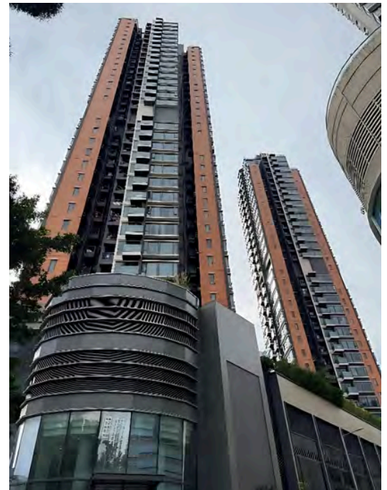
The latest transaction revealing a substantial fall in market value was at Maya in Yau Tong.

Maya is located at Sze Shan Street and Shung Shan Street in Yau Tong. The factory buildings in the area are being rebuilt at an active pace, and a number of new residential projects have been completed in recent years. It takes about 10 minutes to walk from the development to MTR Yau Tong Station.