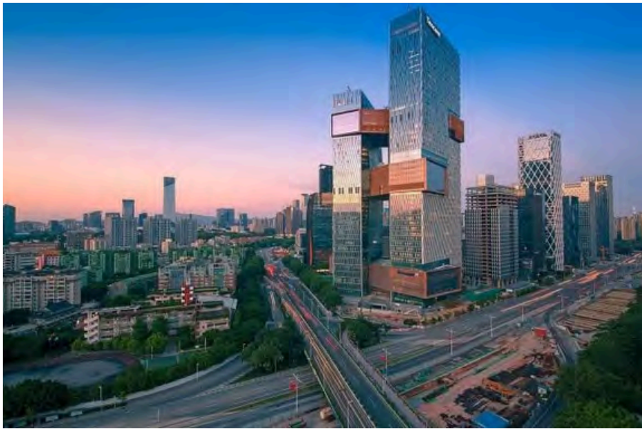
Part of Yuehai Street, Nanshan District, Shenzhen.

From this stunning land sale, developers are still eager to acquire high-quality plots with excellent locality, even paying a costly premium and subject to various special development conditions stated on the land grant. They may only reserve the capital for the plot with huge development potential and forgone those plots locate in secondary tier districts. We can expect that after the market recession, the average price per sq.m. of residential developments launching in Shenzhen will be rebounded owing to the high land acquisition cost. Thus, the sale program shall tend to target on high-value-added buyers in the country.