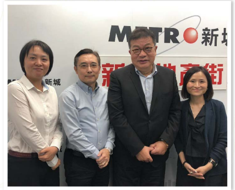
Metro Radio: Metro Property Street 新城電台: 新城地產街